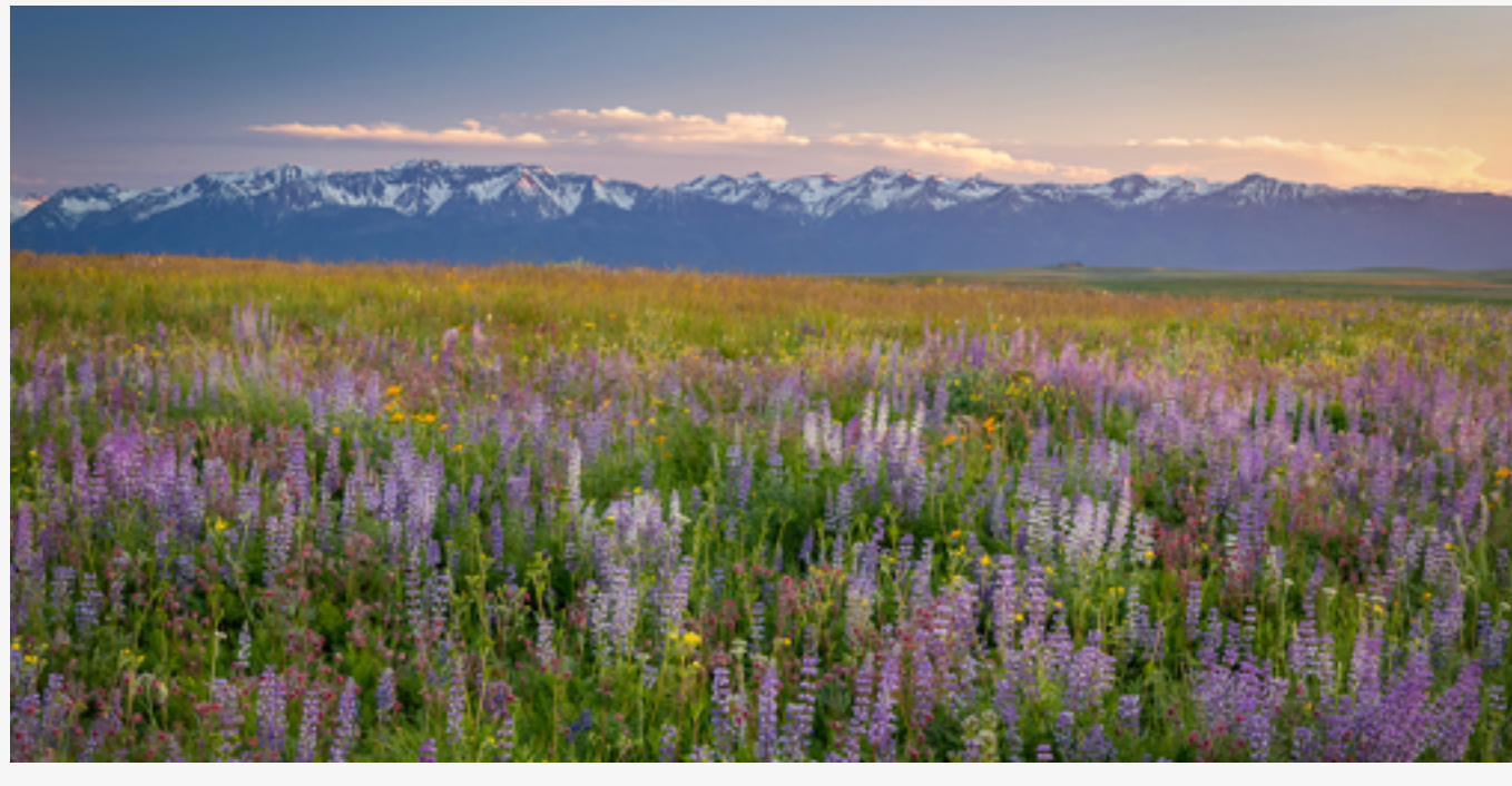
Early summer wildflowers on the Zumwalt Prairie, with the Wallowa Mountains in the distance.