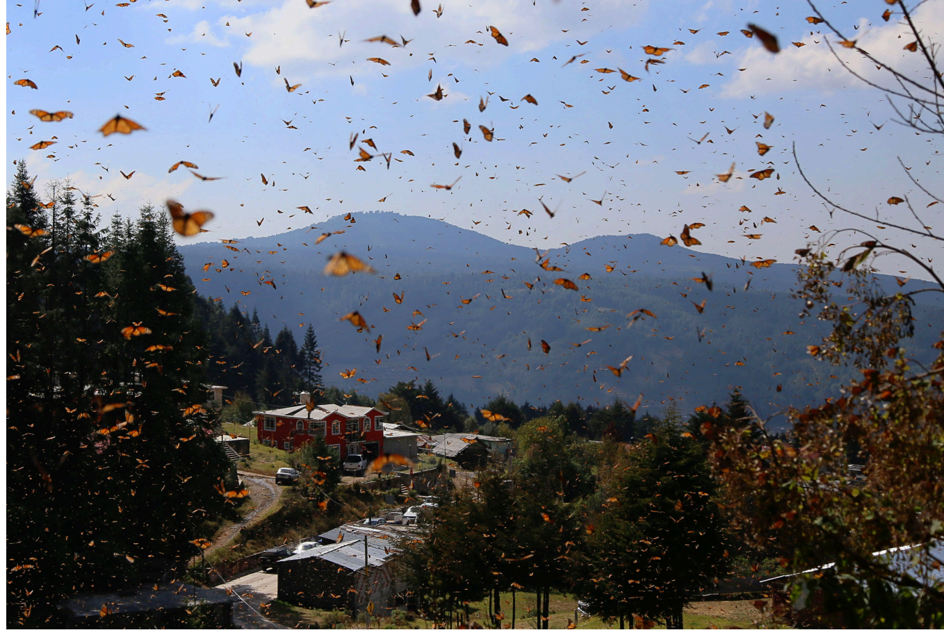
FLUTTER SPEED MEETS SHUTTER SPEED Monarch butterflies fill the air around on the mountaintops in the Monarch Butterfly Biosphere Reserve, a UNESCO World Heritage Site in Michoacán, Mexico.

The migratory monarch butterfly, a subspecies of the monarch butterfly, was recently added to the IUCN's Red List as an endangered species, due to pressures from habitat loss and climate change.