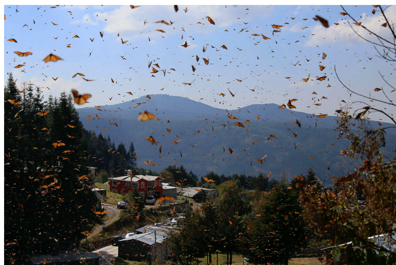
FLUTTER SPEED MEETS SHUTTER SPEED Monarch butterflies fill the air around on the mountaintops in the Monarch Butterfly Biosphere Reserve, a UNESCO World Heritage Site in Michoacán, Mexico.

The migratory monarch butterfly, a subspecies of the monarch butterfly, was recently added to the IUCN's Red List as an endangered species, due to pressures from habitat loss and climate change.