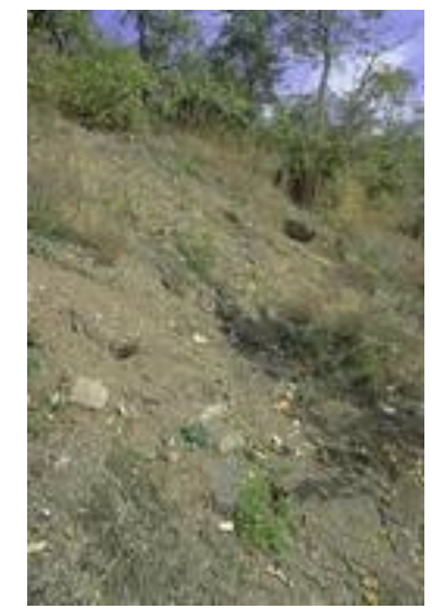
Shale Barrens are especially important because they contain several endemic species.

or industry, and the area is sparsely populated. This isolation has allowed Sideling Hill Creek to have supremely high water quality and healthy aquatic communities. Due to the hydrology of the shale barrens, the water level in this clean creek is highly variable. This variability is