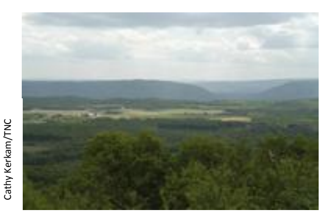
Sideling Hill Creek is part of the ridge and valley region of Allegany forest.

Follow I-70 West from Frederick to Hancock. Take I-68 West towards Cumberland. Exit I-68 at High Germany Road. Turn right at the stop sign. You will cross Sideling Hill Creek after just a couple hundred feet (bridge is inconspicuous). Immediately after crossing the creek, take a sharp right (back-angle) down dirt lane to edge of hay field. Park in the fenced parking area. Please do not block access to dirt lane across the field.