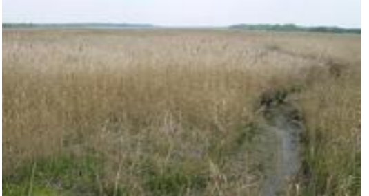
Many types of marsh vegetation exist at Choptank.

Conservancy and the Waterfowl Festival, Inc., which shared the cost of land acquisition and construction of the boardwalk and observation platform. Current stewardship work