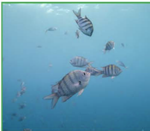
SERGEANT MAJOR FISH PEZ SARGENTO MAYOR