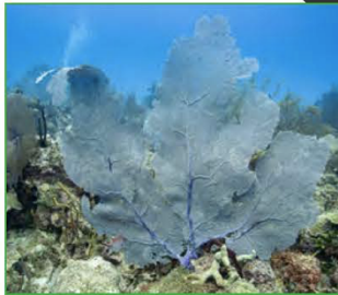
FAN CORAL CORAL ABANICO

El objetivo de este es simple—encuentra los tantos animales y plantas de la siguiente lista durante el viaje virtual y marca las casillas cuando logres verlos. Las fotos son para inspiración; los objetos pueden verse ligeramente diferentes durante el evento. ¡Buena suerte!