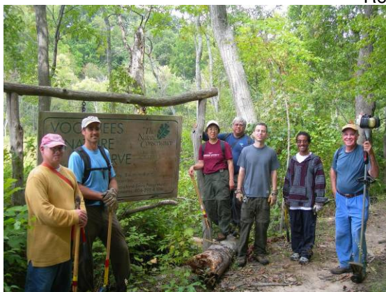
Voorhees Preserve

THANK YOU for deciding to help maintain and monitor Voorhees Preserve. Volunteers make it possible for the Conservancy to continue protecting nature and preserving life.