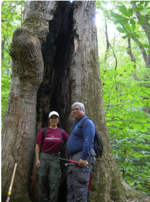
Volunteers at Voorhees Preserve

Being a Volunteer Visitation Committee Member for The Nature Conservancy gives you the opportunity to help protect critical habitat for plants and animals that is quickly disappearing. Members will gain valuable experience in the field and have the opportunity to increase leadership skills.