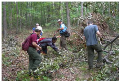
Voorhees Preserve Workday