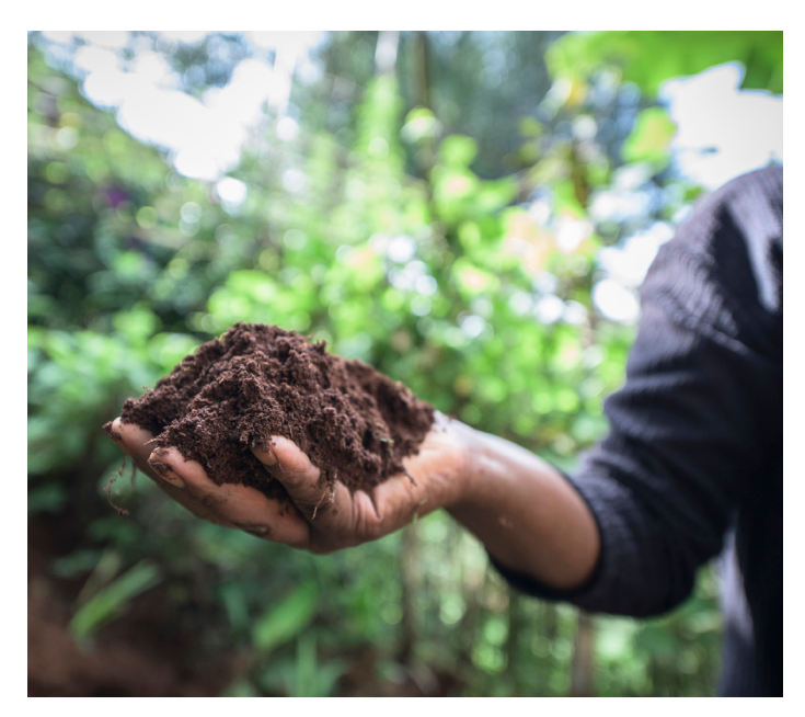
Jane Kibugi's holding fresh soil on her hillside farm in the Upper Tana Watershed, Kenya.

These solutions are available immediately, are scalable, and can transform key sectors of the global economy, such as forestry and agriculture – they are also available almost everywhere on the planet. Combined with innovations in clean energy and other efforts to decarbonize the world's economies, natural climate solutions offer some of our best options in the response to climate change. A 2 or 1.5 degree Celsius stabilization pathway is unlikely to occur without taking land use more seriously. Or put simply, we cannot get there without nature.