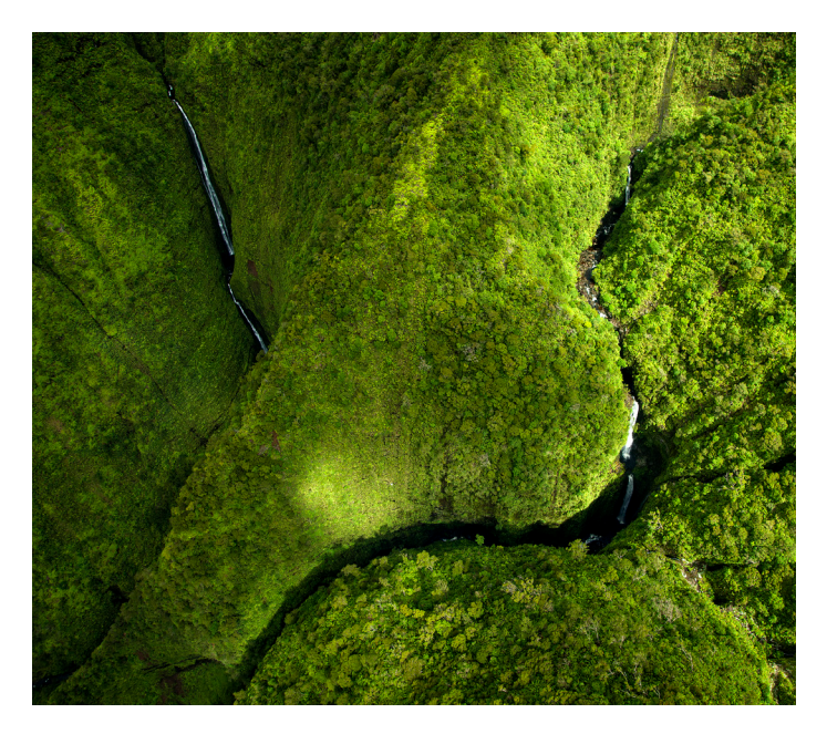
Waterfalls pour down into Wainiha Valley, Kauai, Hawaii.