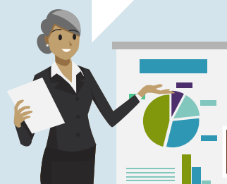
CA Utility CEO

Buying CARBON OFFSETS to cover up to 8% of my emissions makes good business sense.