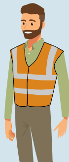
VA Forest Manager

The Nature Conservancy's forest managers INCREASE the rate of CO 2 removal by growing a healthier, more diverse forest