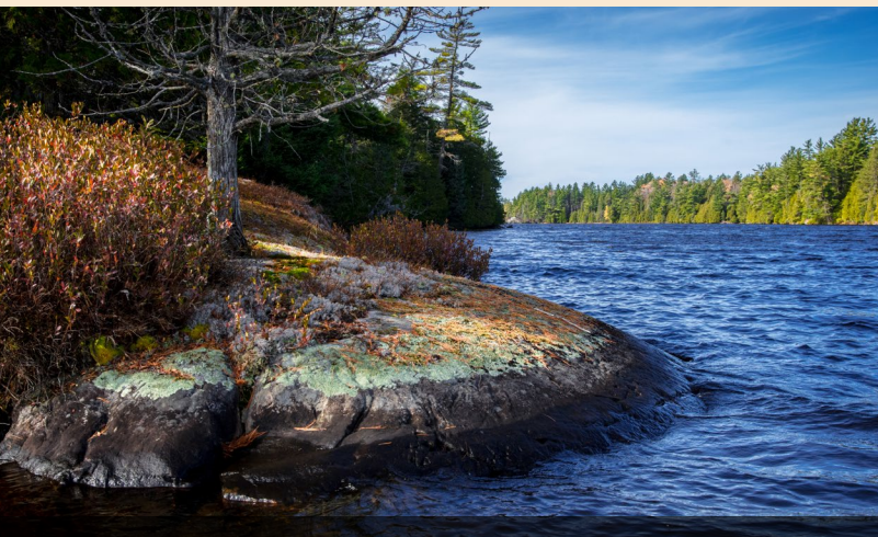
On forest reserves like our Wilderness Lakes Reserve, TNC shows how the right practices can not only promote forest health and biodiversity, but also help reduce the greenhouse gases that lead to a warming climate. Established by TNC in 2017, this reserve was later expanded to over 10,000 protected acres of spectacular forestland, high-quality wetlands and glacial lakes.