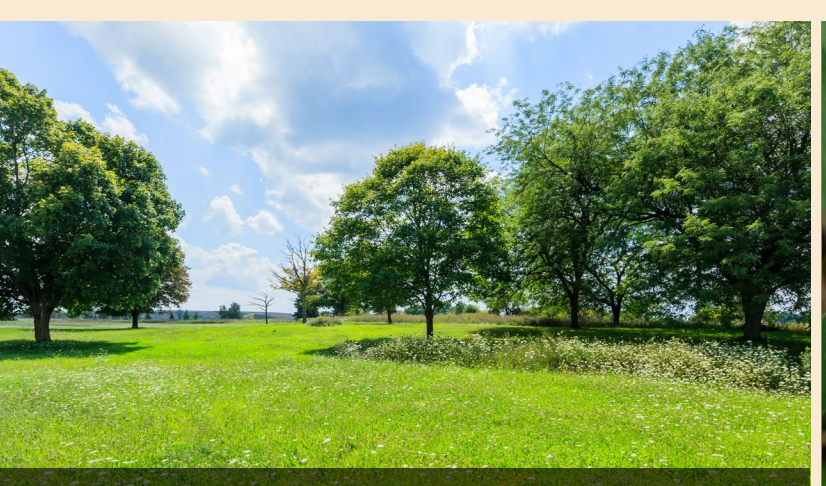
In 2020, TNC and many partners achieved a major policy victory when Michiganders voted YES on a ballot proposal that ensured funding for our state's water, wildlife and parks through the Michigan Natural Resources Trust Fund. This fund has supported many protected places in Michigan, including the Saugatuck Habor Natural Area and the new Saginaw River Headwaters Recreation Area—preserves and parks that TNC helped establish.

From policy to partnership, from Upper to Lower, TNC protects the thing that matters most: our home.