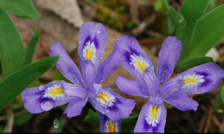
In 2018, TNC acquired 1,400 acres and four miles of shoreline on the North Point Peninsula, surrounded by Lake Huron's Thunder Bay Marine Sanctuary. By holding this special property until we could transfer it to a local nonprofit group, we secured protection for habitat that shelters thousands of migratory birds every year, as well as rare species like the dwarf lake iris.