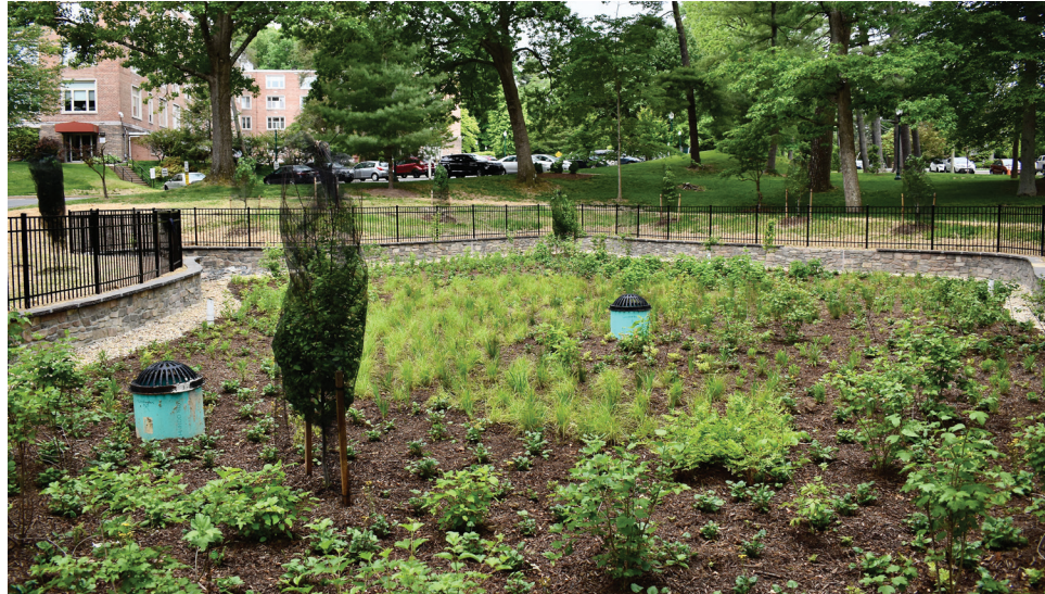
A new stormwater infrastructure project at the Knollwood Life Plan Community in Northwest D.C. captures 3 million gallons of stormwater annually before it runs into Rock Creek.

Make a donation with the enclosed envelope or online at nature.org/donate