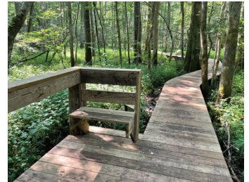
Nassawango boardwalk

The Nature Conservancy's Nassawango Creek Preserve on the Lower Eastern Shore of Maryland is a true spectacle of wild beauty. The preserve is not only home to a diversity of wild-life and native flora, such as river otters, red-shouldered hawks and pitcher plants, but it is also open for public exploration.