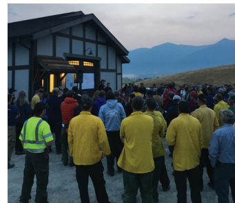
Firefighters are briefed in Montana.

The Kentucky chapter’s expertise with prescribed fire—a management tool that can prevent or lessen the intensity of wildfire—represents a valuable skill set for TNC and its partners. Wildfire training and experience is required to become a prescribed fire burn boss.