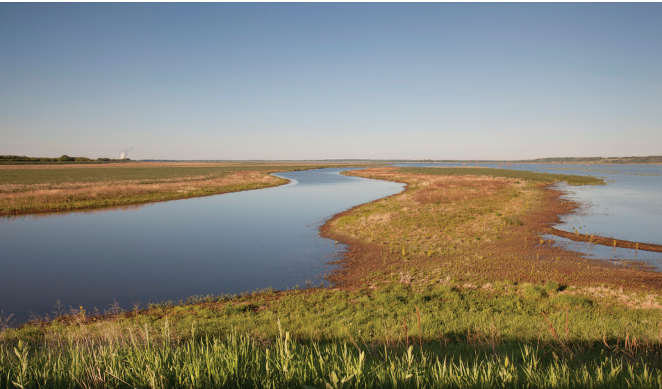
A five-year, $1.36-million study will look at the science behind wetland restoration.