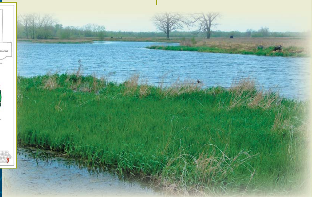
Amphibian and reptile habitat