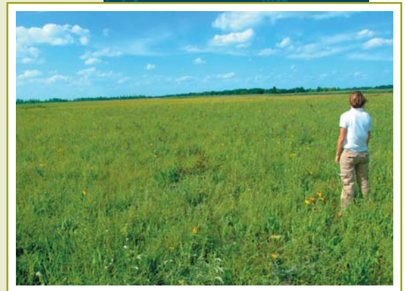
A prairie seed production field

Investments in the Iowa Wildlife Action Plan have improved Iowa's ability to restore native prairie landscapes that are so important to Iowa's wildlife.