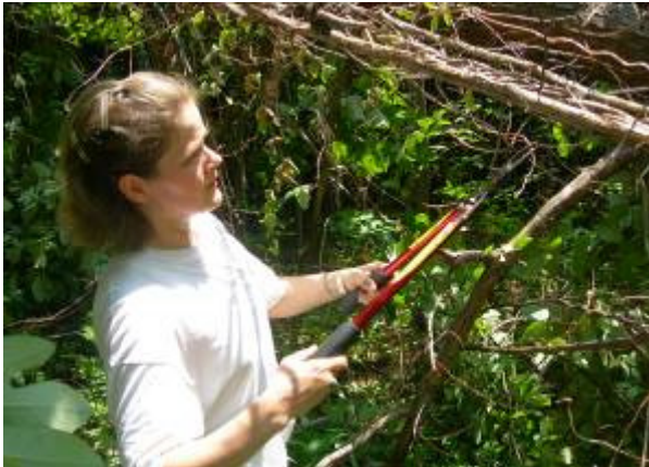
Fortune's Cove Preserve Workday

To date, the Conservancy has protected more than 23,000 acres and more than 100 miles of streams in the Piedmont, one of the nation's fastest growing regions. Many significant natural areas here still need protection, including 22 examples of large native forests and five river systems spanning 2.6 million acres. Using various creative strategies, the Conservancy is working with partners to conserve the Piedmont's finest remaining lands and waters before they disappear.