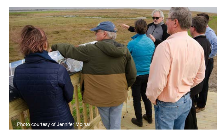
Dow, The Nature Conservancy, and external partners touring one of Dow's closed landfills that was converted into a wetland.