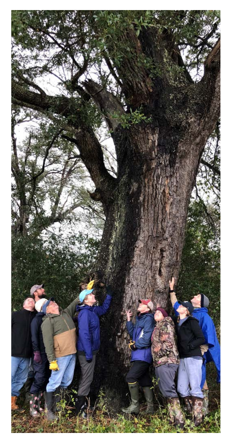
Dow and The Nature Conservancy team members assessing forest growth at The Nature Conservancy's Brazos Woods Preserve in West Columbia, Texas.