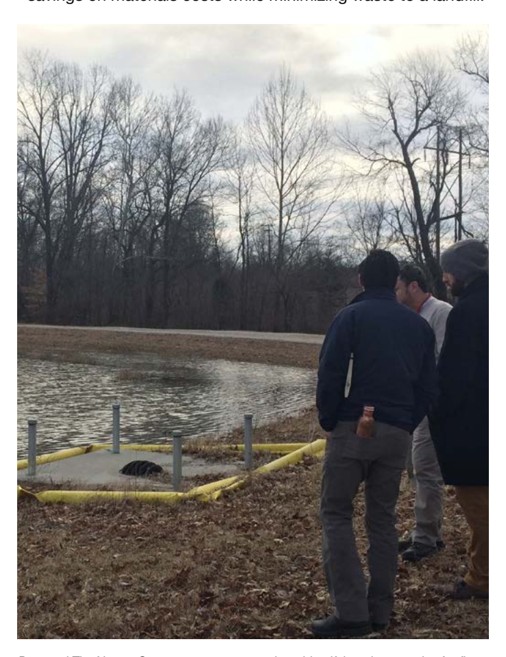
Dow and The Nature Conservancy team members identifying plant species for fire retention pond plantings in Elizabethtown, Kentucky.