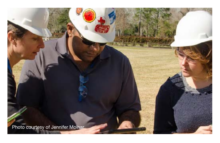
Dow and The Nature Conservancy team members using the ESII Tool at freshwater pumphouse in Lake Jackson, Texas.