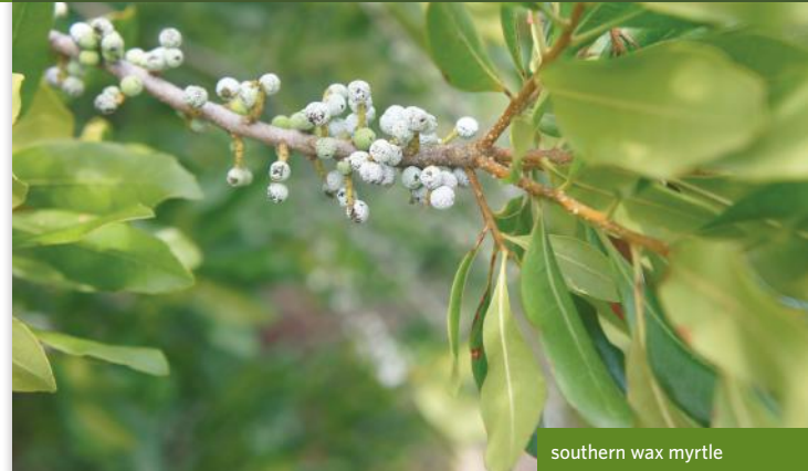
southern wax myrtle

flowering dogwood: Robert H. Mohlenbrock, hosted by the USDA-NRCS PLANTS Database / USDA NRCS. 1995. Northeast wetland flora: Field office guide to plant species. Northeast National Technical Center, Chester.