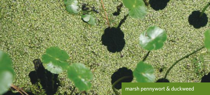
marsh pennywort & duckweed