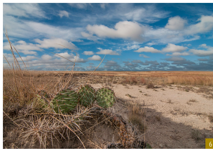
1. Red Hills of south-central Kansas © Jim Griggs; 2.Red-legged grasshopper on snow-on-the-mountain © Jim Griggs; 3.Pronghorn © Justin Roemer/TNC; 4. Yucca © Meleda Wegner Lowry; 5. Burrowing owl © Paulette Donnellon/TNC Photo Contest 2022; 6. Cactus at Smoky Valley Ranch © Chris Helzer

16 THE NATURE CONSERVANCY 2022 YEAR IN REVIEW SOUTHERN HIGH PLAINS 17