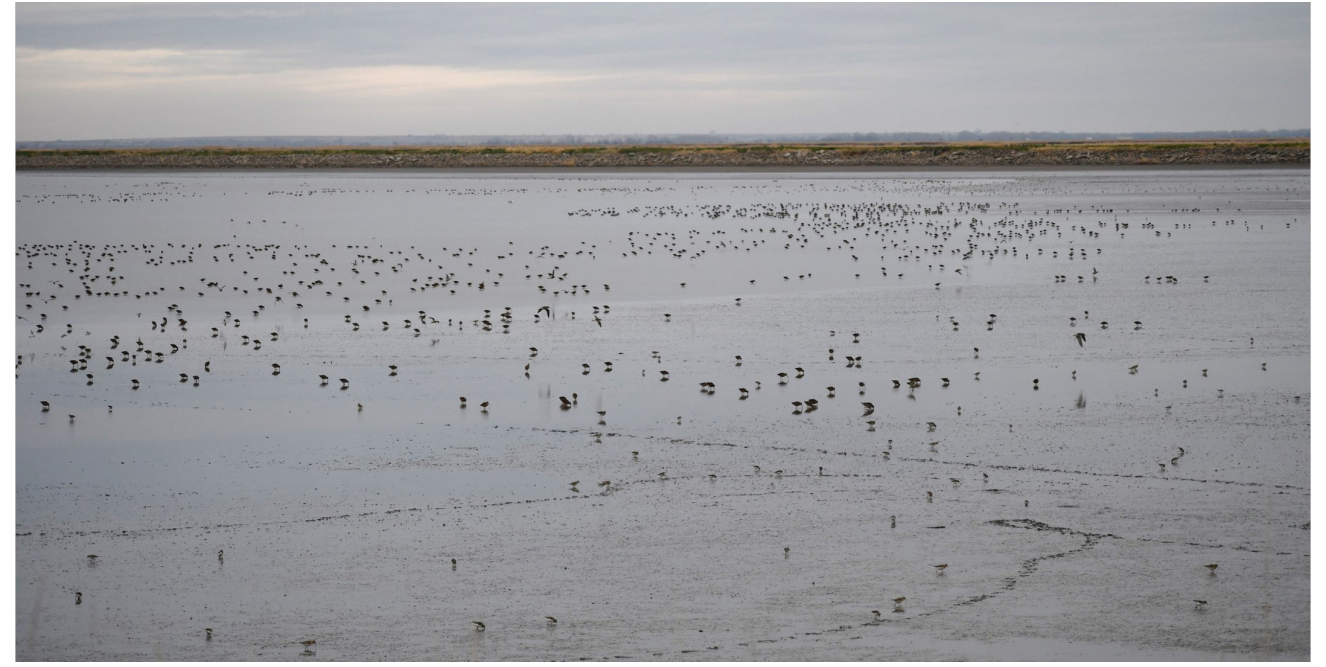
Hundreds of shorebirds at Cheyenne Bottoms Preserve in April 2022

EDITOR'S NOTE: After Spring 2022 saw record bird numbers, drought soon set in. Cheyenne Bottoms was completely dry during fall migration. Fortunately, a late October rain filled the marshes at Quivira National Wildlife Refuge, just 45 miles to the south, ensuring a place for these long-distance migrants to rest and refuel. Read more about our work around Quivira on page 23.