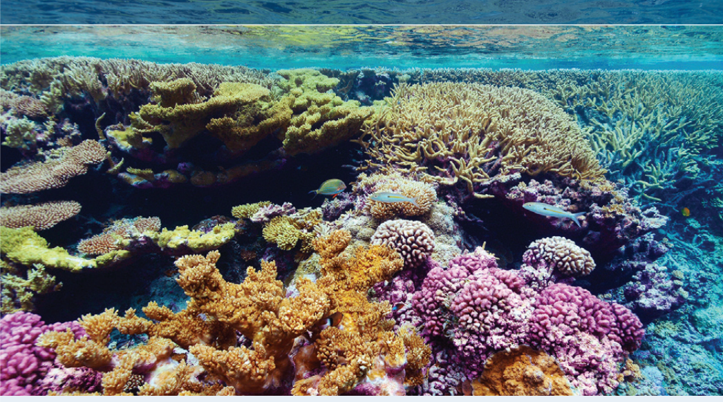
Vibrant coral reef at Palmyra Atoll